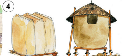
4 Store in bulk or in bags in a dry place.