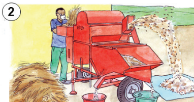
2 If possible, thresh, sift and wash the grains mechanically to reduce work.