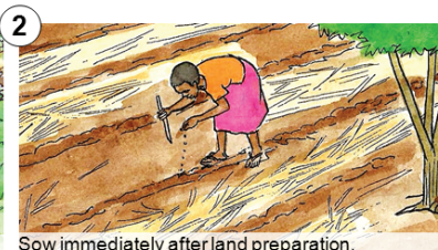
2 Sow immediately after land preparation.