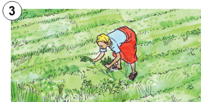
3 Remove weeds 4 to 7 weeks after sowing.