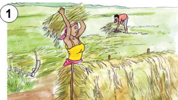
1 After harvest allow the fonio sheaves to dry for one or two weeks on well-aerated heaps.