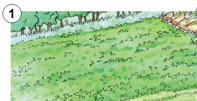
1 Reduce weed pressure before fonio growing a suppressive crop. Sanitize Striga infested fields.