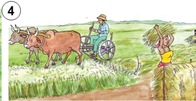
4 Avoid dispersal of weed seeds during harvest of fonio.